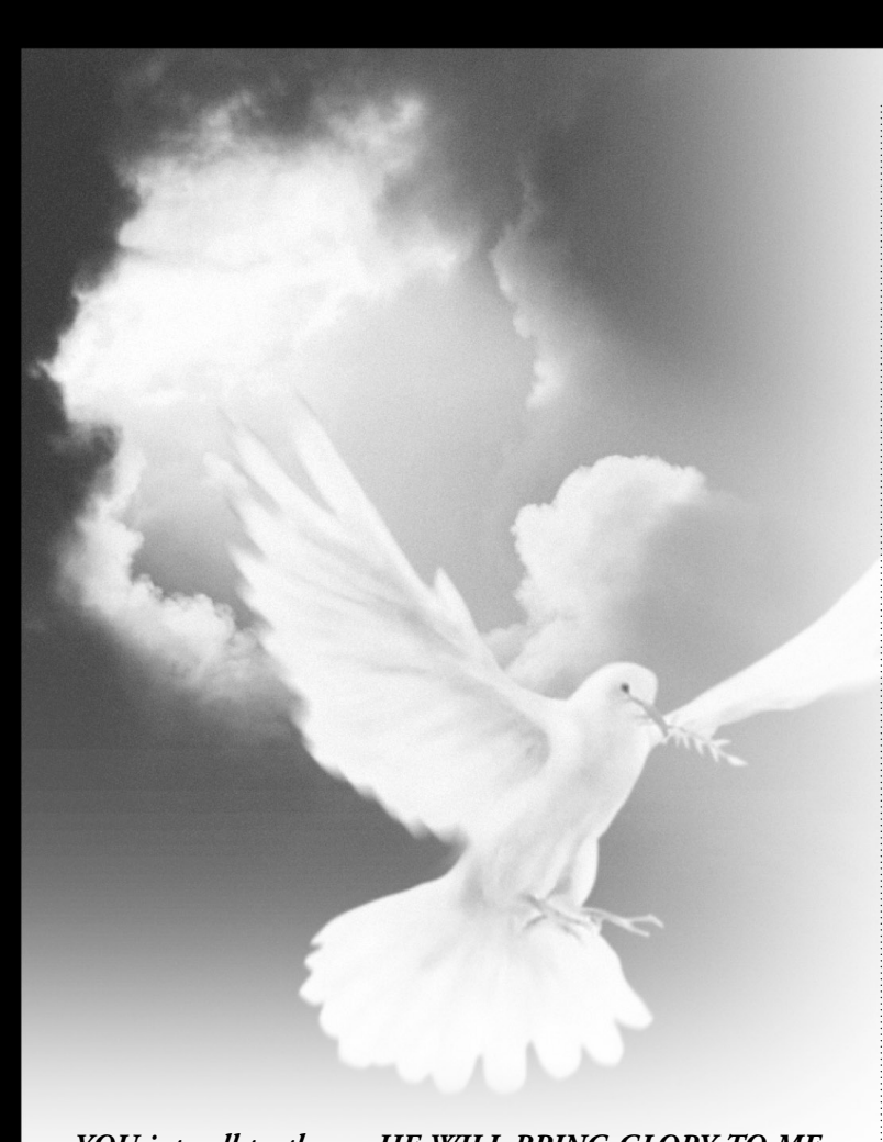
YOU into all truth. . . . HE WILL BRING GLORY TO ME by taking from what is mine and making it known to you." —John 16:7,13,14. (Unless otherwise noted, all Scriptural texts in the DISCOVER guides are from the New International Version of the Bible [NIV].)

1cGuid11.gxd 6/22/00 5:27 PM Page 2 (Black plate)